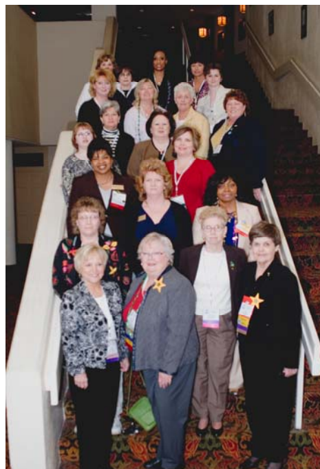
Georgia Council Members at April Regional Conference in Gatlinburg, TN