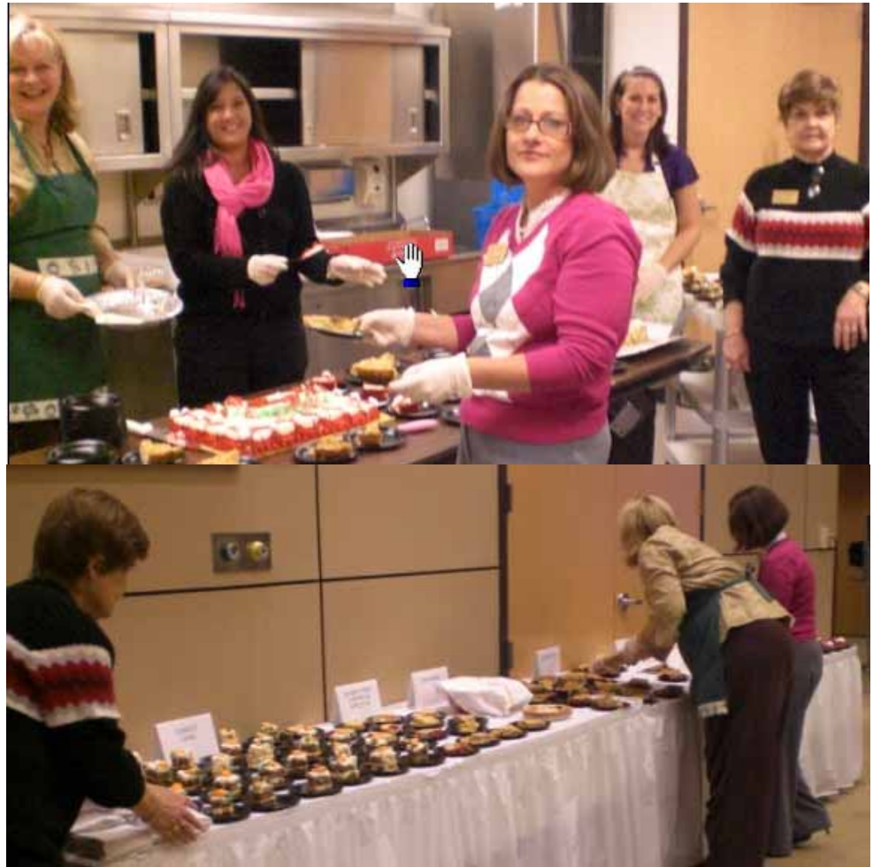
Table full of desserts for the patients of the Shepherd Center.