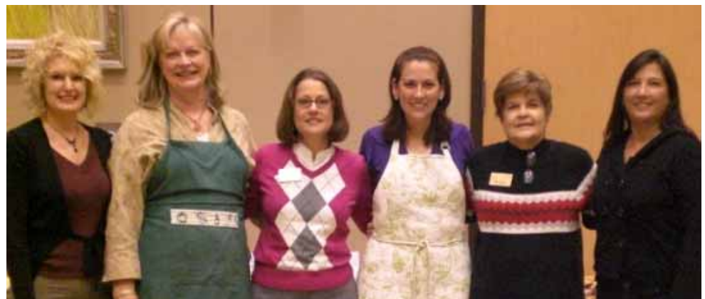
Left to Right Insurance Professionals of Atlanta